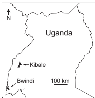
FIG 1 Map of Uganda (in East Africa) showing the locations of Kibale National Park (Kibale) and Bwindi Impenetrable National Park (Bwindi).

and nonlinear decrease in the proportion of resistant isolates with increasing local antibiotic prices ( r^2 = 0.68 ; t = -3.8 ; P = 0.007 ; Fig. 2), with the most expensive antibiotics (nalidixic acid and ciprofloxacin) associated with very low resistance proportions (0.8% and 0.4% of isolates, respectively).