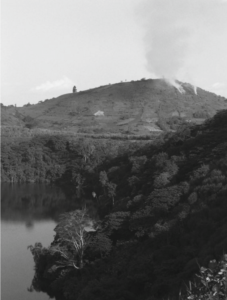
Fig. 7.2 A typical forest fragment surrounding a crater lake neighboring Kibale National Park, Uganda

While domestic consumers use the most plant species for fuelwood (>50), their consumption is potentially sustainable because they generally harvest fast-growing species from fallows on their own land or their neighbors' land. In contrast, commercial charcoal producers prefer old-growth hardwood species and are responsible for the greatest loss of natural forest. They access forests by finding landholders who, either willingly or through coercion, allow trees on their lands to be cleared. The impact of charcoal production is exacerbated by a license system in Uganda that undervalues natural forests and rewards rapid harvesting across large areas (Naughton et al. 2006).