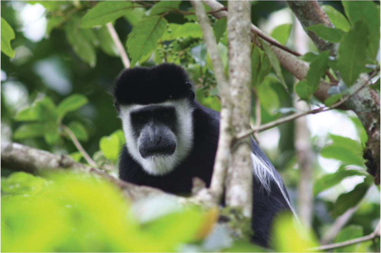
Figure 1. Black-and-white colobus monkey, Colobus guereza , from Kibale, Uganda.

existing evidence clearly demonstrates i ) the cost of grouping to individuals, ii ) the limiting effect of food competition on group size, and iii ) the mechanism behind the relationship between group size and day range. While acknowledging that observed group sizes will be confounded by variables such as predation risk, resource defense, and mating strategies, the ecological constraints model proposes that the upper limit on group size is set by the increasing costs of travel imposed in larger groups. The application of this model to folivores has rarely been examined, but see Gillespie and Chapman 44 and Ganas and Robbins. 45