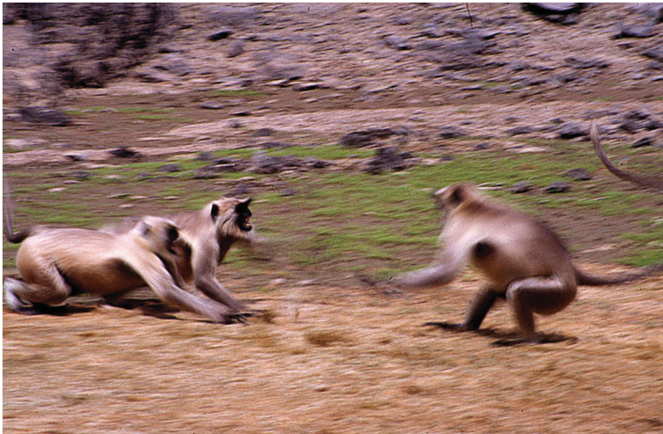
Figure 2. Female aggression during between group encounters as illustrated by female Hanuman langurs ( Semnopithecus entellus ) from Jodhpur, India.

havioral, and energetic, needs to be recognized.