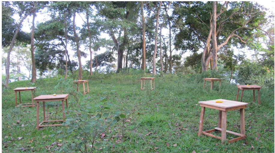
Fig. 1 Experimental set up of seven feeding platforms arranged in a circle, 3 m apart. Platforms are set up for Experiment 1A

number and order of visits to each platform during trials. A visit was scored any time an individual jumped onto one of the feeding platforms. All repeat visits were also scored and the order of visitation was noted. Not all platforms were visited during every trial, depending in part on participants' knowledge of where food was located.