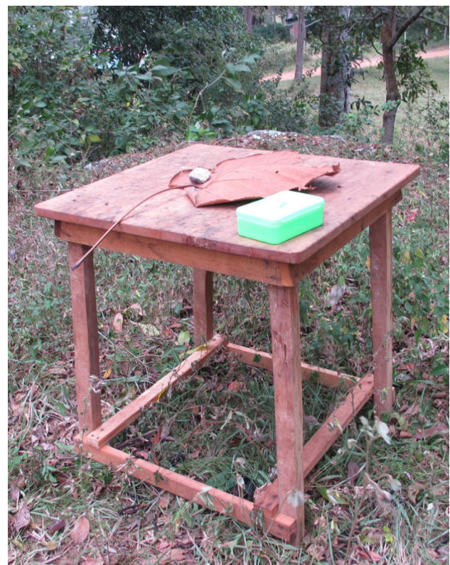
Fig. 2 Feeding platform set up for Experiment 3, with reliable beacon provided

For Experiments 2A and 2B, results did not differ from chance and it was considered advantageous to determine the strength of the null hypothesis relative to the alternative hypothesis using a Bayesian analysis (Gallistel 2009; Kruschke 2011). The distribution of individual success rates (visitations to real vs. sham sites) during these two experiments were examined with one-sample t tests, first